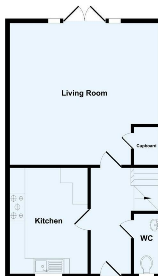
Ground Floor Approx. Floor Area 40.72 Sq.M. (438 Sq.Ft.)

Second Floor Main Bedroom 4.75m (15'7") x 3.94m (12'11")